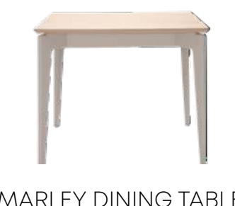
MARLEY DINING TABLE