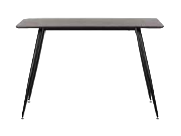
PABLO DINING TABLE