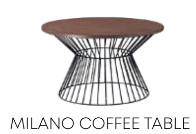
Available in other colours