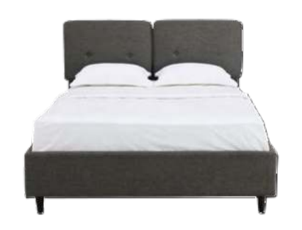
CAREN DOUBLE BED FRAME & ORTHOPAEDIC MATTRESS