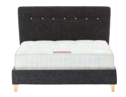
PAISLEY DOUBLE BED FRAME & ORTHOPAEDIC MATTRESS