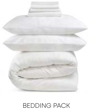
FROM £140 +VAT