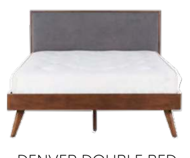
DENVER DOUBLE BED FRAME & MATTRESS