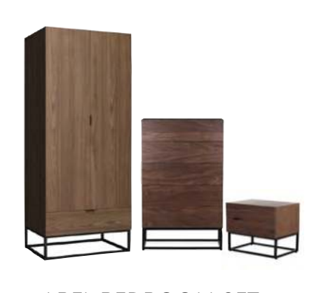
ABEL BEDROOM SET

*Wardrobe available at an additional cost