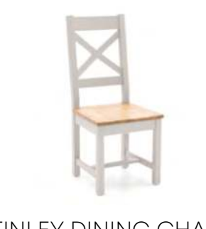
FINLEY DINING CHAIR