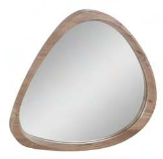
MIRRORS FROM £135 +VAT