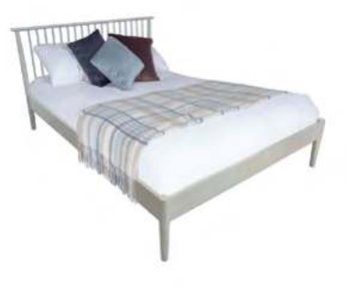
ADA DOUBLE BED FRAME & MATTRESS