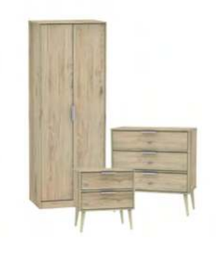
RIVER BEDROOM SET

*Wardrobe available at an additional cost