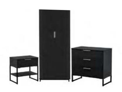
KATRINA BEDROOM SET

*Wardrobe available at an additional cost