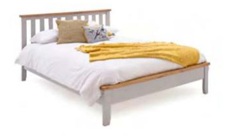
FINLEY DOUBLE BED FRAME & MATTRESS