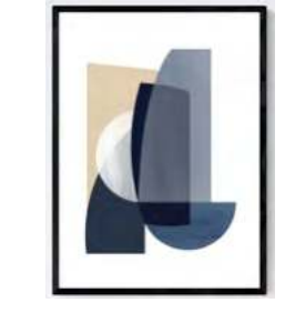
PRINTS FROM £65 +VAT EACH